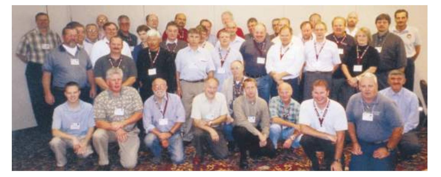
A rare event indeed is captured by this photograph, that is, the auditors, staff and the Task Group members all together in one place at one time. This photo was taken at the October 2003 Auditor Training Session held in Pittsburgh Pennsylvania.