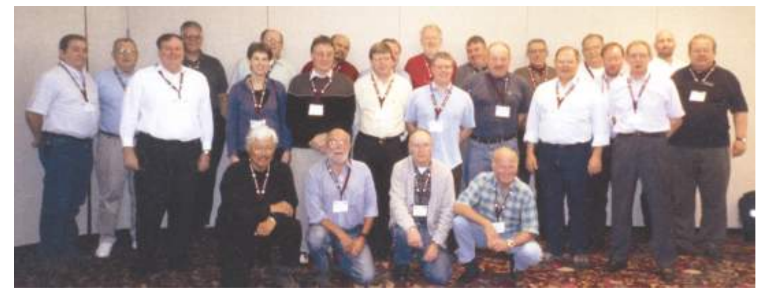
PRI gathered the NDT auditors from literally all over the world to take this photo. As you can see, the auditors do smile, at least when they are having their photograph taken.